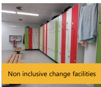
Non inclusive change facilities