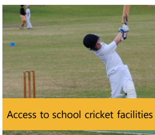
Access to school cricket facilities