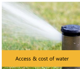
Access & cost of water