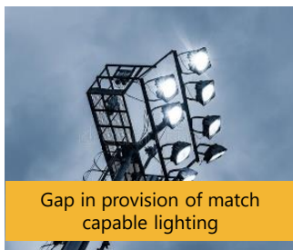
Gap in provision of match capable lighting

A number of key infrastructure issues and challenges were identified following engagement with key stakeholders. While not all of the below findings will apply to every local region and facility across South Australia, they provide a brief summary of several of the state's more critical infrastructure challenges that will need to be addressed in the strategy.