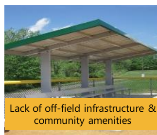
Lack of off-field infrastructure & community amenities