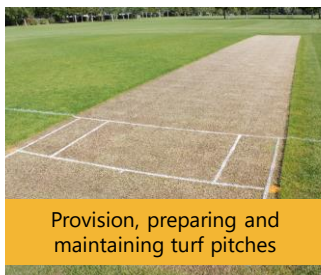
Provision, preparing and maintaining turf pitches