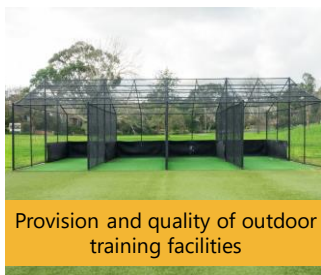
Provision and quality of outdoor training facilities